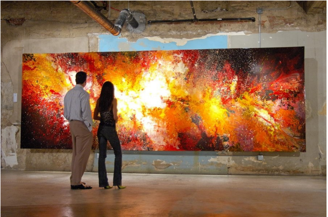
The Answer, 96"x 240", acrylic on canvas